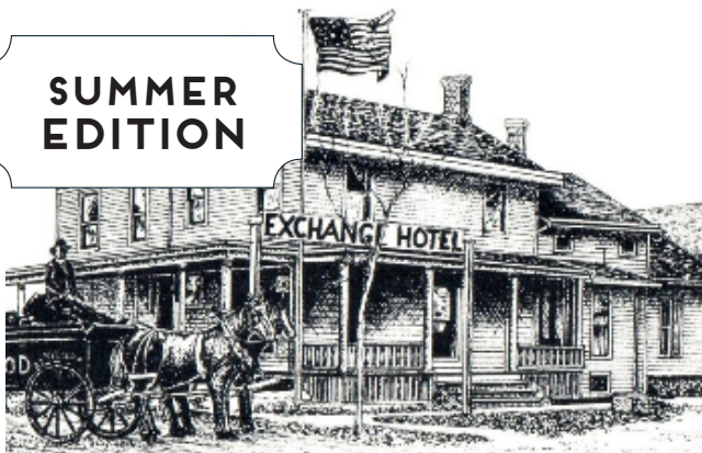
Sanborn Exchange Hotel

Nestled in the heart of Sanborn since 1912, this property has been a long-standing part of the community's railroad history. This building has had many names from The Sanborn Exchange Hotel to The Marlboro Inn. It has persevered through two major fires and has always come out for the better. We are proud to carry on the tradition of the "Marlboro". It was born in 1912 but it was resurrected in 2024. Join us in celebrating the legacy of this wonderful building as it continues for a new generation of Sanborn residents.